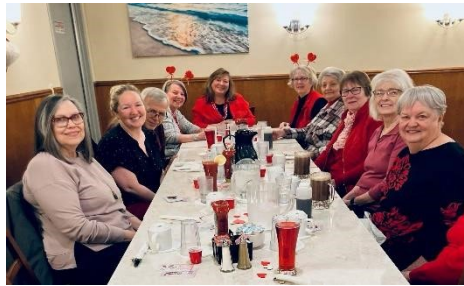
Valentine's Day Breakfast Klub