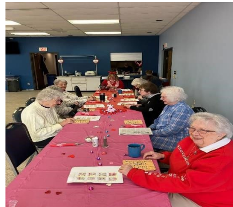
Bingo – Valentine Party