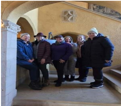
Hiking at Riverbend in Kohler