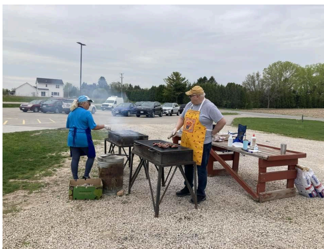
Klub 55 Brat Fry