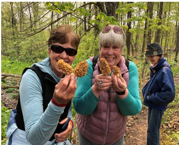
The hikers found morels!

We will have coffee, and soda is available for purchase. Not playing cards, please feel free to stay for a little coffee and conversation or even a game of dominos.