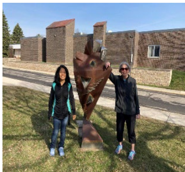
Hikers enjoying the outdoors!