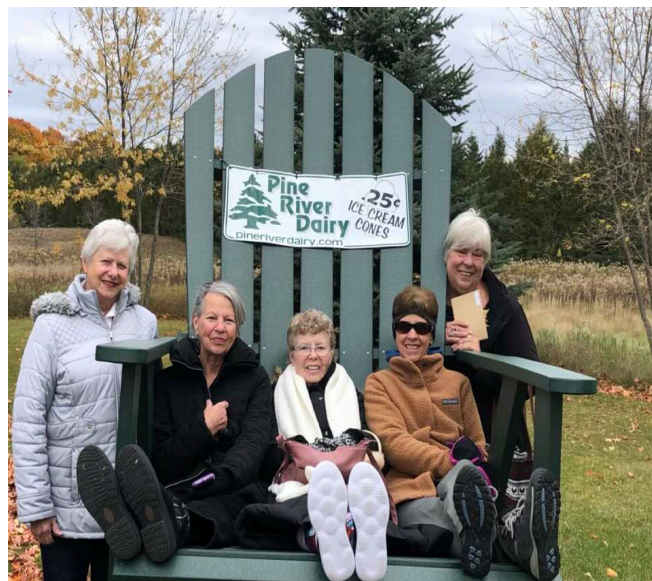
Having Fun with Klub 55