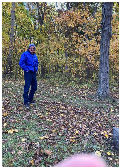
Haunted Cemetery Tour